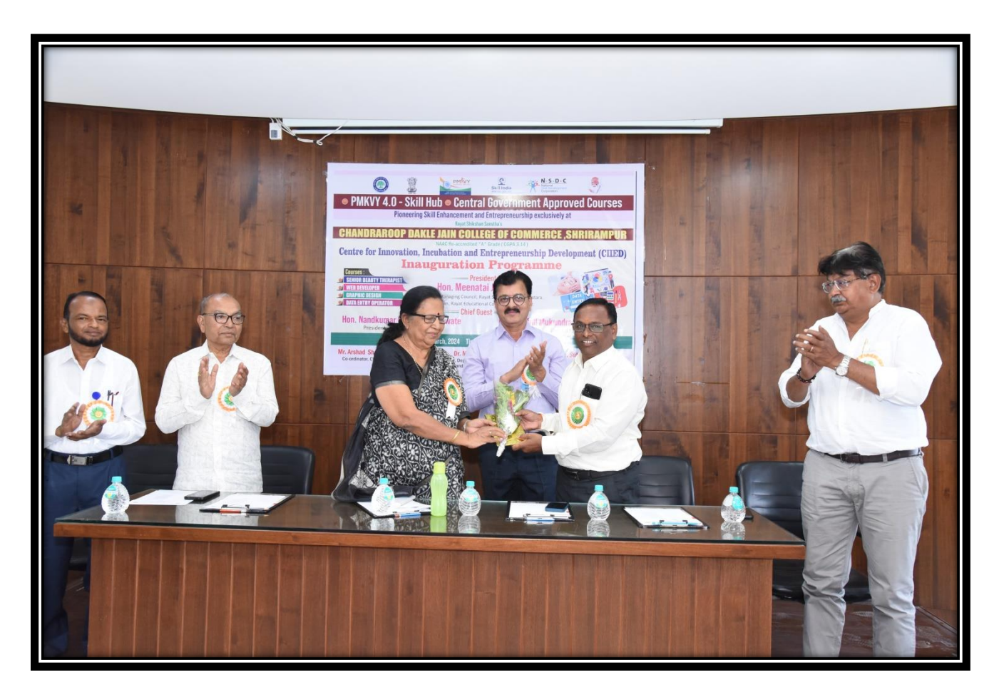
Felicitation of Guests